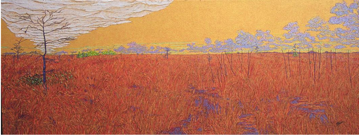
Pa Hay Okee Orange, Everglades National Park, acrylic, 2005, 19 x 49 in.