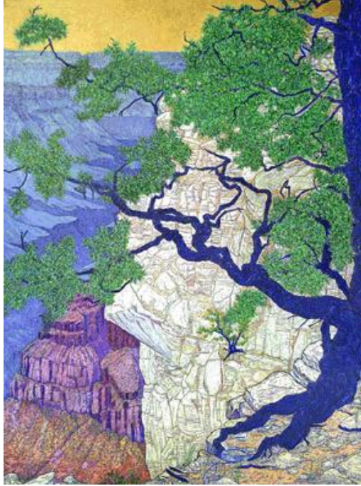
Imminent Depth , Grand Canyon, North Rim, acrylic, 2008, 41 × 31 in.